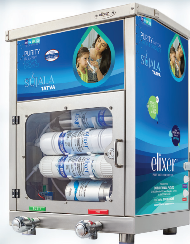
Table Top / Wall Mounted

RO (15 LPH) UV+UF (60 LPH) 15 Ltr Storage